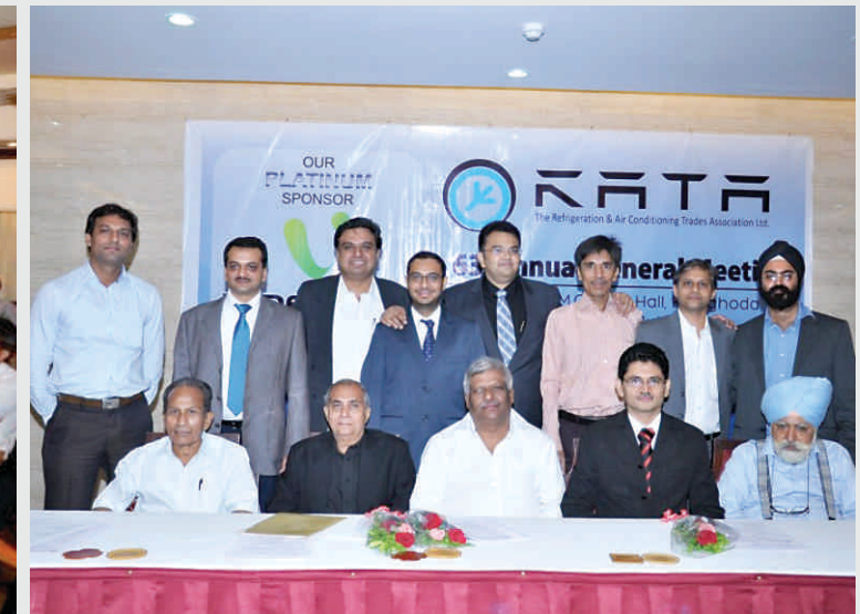
RATA 63rd Annual General Meeting on 28th July, 2012

Both events held at Mumbai were very successful. Grass entrepreneurs of the industry & trade were present for close interaction among RATA Members.