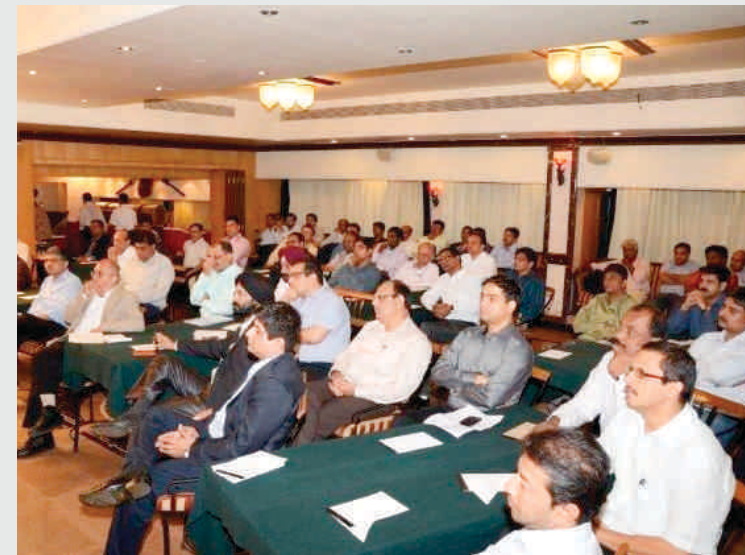
RATA Talk Show on 13th March, 2012