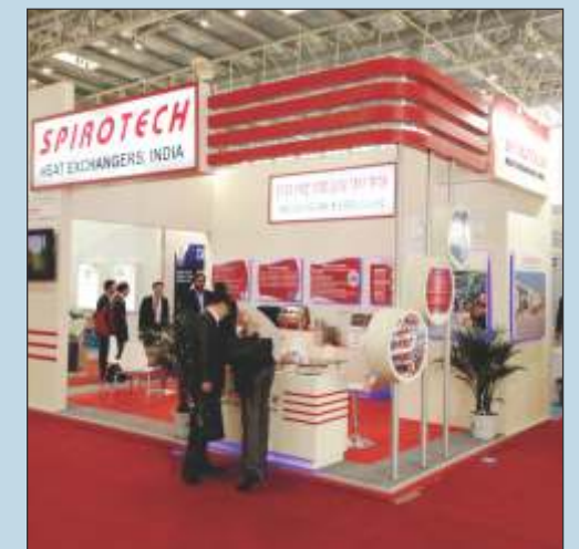
AIACRA Member's Stall at CR-2014 Expo