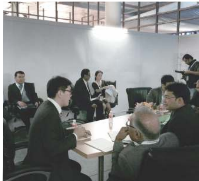
Buyer-Seller Meet at ACREX India - 2014, New Delhi

AIACRA organized its first Buyer-Seller Meet on 27 th February, 2014, the first day of ACREX India-2014.