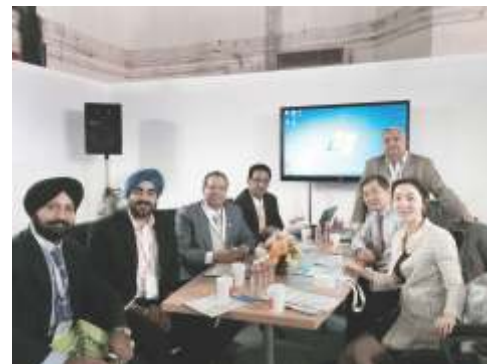
AIACRA EC Member with President KRAIA