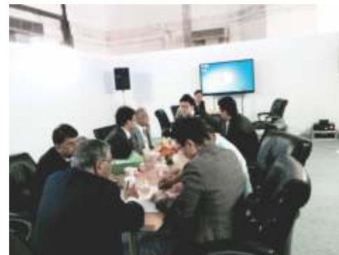
AIACRA Members at Buyer-Seller Meet