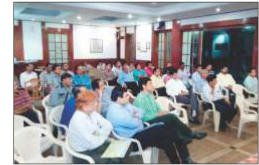
Members at AGM

RATA-SI (Refrigeration & Air-Conditioning Trades Association-South India) held their 60 th Annual General Meeting (AGM) on 19 th February 2014, at Madras Cricket Club, Chepauk, Chennai. It is noteworthy that RATA-SI has completed 60 years of its formation, and is the oldest & foremost trade body in refrigeration & air-conditioning trade, all over India.