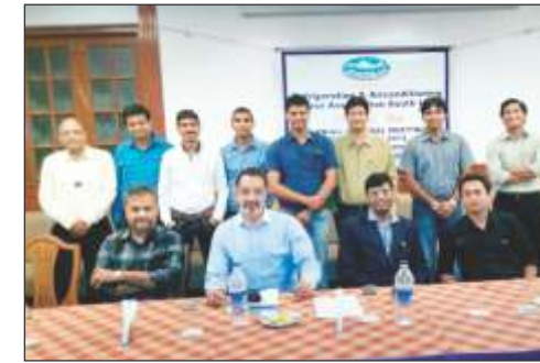
RATA-SI New Executive Committee