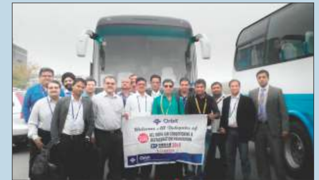
AIACRA 11th Delegation to CR-2014, Beijing, China