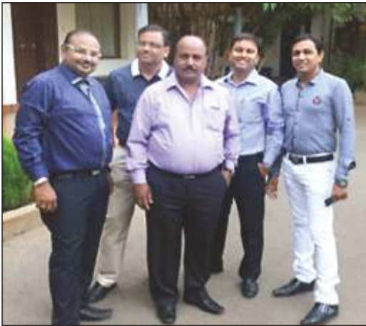
Team Of Twin Cities Refrigeration Dealers Association (Secunderabad)