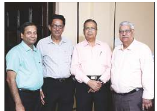
Present & Past Presidents, AIACRA & NIRATA