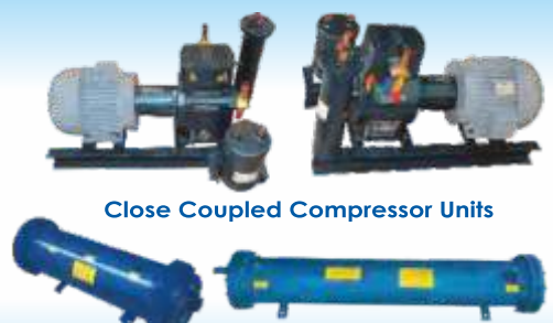
Close Coupled Compressor Units