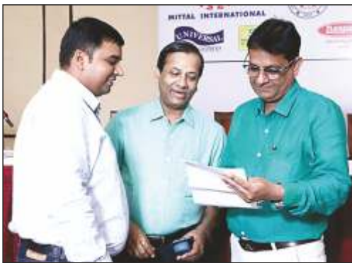
NIRATA Office bearers