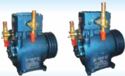
DI-Q5 DI-Q7 "DALTON INDIA" Hi-Speed Compressors Models

Email: info@daltonindia.com Website: www.daltonindia.com