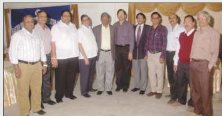
EIARA, Kolkata AGM held on 14th December, 2012